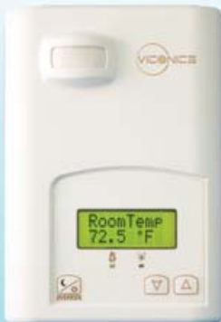
VZ7200F5500B with PIR motion sensor

The Viconics VBZS BACnet® Zoning System has been specifically designed to bring a simple scalable BACnet® solution to the commercial mid-market without the cost associated with typical DDC type zoning systems.