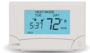
PSP711TS The LuxPro Touch Screen Thermostat

For many reasons, the decision to go with LuxPro thermostats can lower your inventory and keep more money in your pocket whether you are a distributor or an installer.