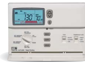
PSP711CC The LuxPro Clean Cycle Thermostat

From the quality of our products to the price points to the lower minimum orders and 24 hours shipping, LuxPro is