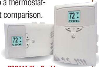
PSPD111 The Double-Duty Thermostat

You'll find innovation, critically engineered features, intuitive design, easy programming and superior aesthetics. When you get to the bottom line, we are absolutely sure you're going to like what you find.