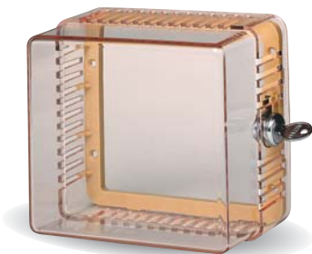
6¾" (172 mm) x 5½" (149 mm) x 3¼" (83 mm) wide/width tall/height deep/depth