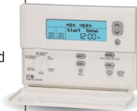
PSP722E The "Pro-Fit" Series

When you sell a LuxPro thermostat – it's sold. All a contractor has to do is install the thermostat correctly and that's it. If there's ever a question or problem,