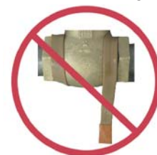
(A) Incorrect Installation: Heating tape hanging free from the surface