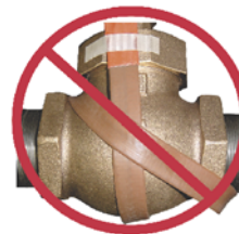
(C) Incorrect Installation: Heating tape overlapped on itself